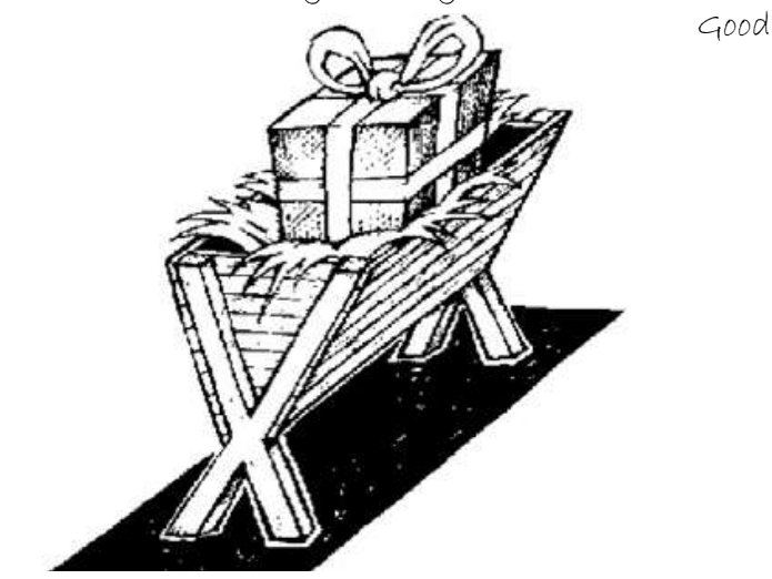
tidings for Christmas and a Happy New Year.

We wish you a Merry Christmas and a Happy New Year. Good tidings we bring to you and your kin;